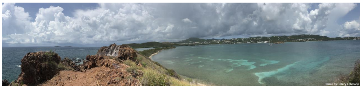
Image of STEER, from Cas Cay looking west.

STEER is one of only three locally managed marine protected areas in the USVI, and the only one in St Thomas (others being St Croix's East End Marine Park and Salt River). STEER includes the waters and cays that are between Mangrove Lagoon in Bovoni and Turquoise Bay in Cabrita Hill, and out seaward to Little St James island (images below). STEER encompasses three distinct Marine Reserves and Wildlife Sanctuaries (MRWS): Cas Cay/ Mangrove Lagoon, St. James and Compass Point Pond ( VIRR Title 12, Ch. 1, §94 & §96 ). Collectively these MRWS contain 9.6 km 2 of valuable coastal, marine and fisheries resources including salt ponds, lagoons, reefs, cays and the largest remaining mangrove forest in St. Thomas. In 2011, The Nature Conservancy (TNC), the National Oceanic and Atmospheric Administration (NOAA) and the U.S. Department of Commerce supported the development of a detailed and comprehensive management plan to focus on all three of the reserves as a single managed unit. Today, STEER refers to the protected area encompassing all three of the MRWS co-managed by the Department of Planning and Natural Resources' (DPNR) divisions of Coastal Zone Management (CZM), Fish and Wildlife (DFW), and Environmental Enforcement (DEE) and Environmental Protection (DEP).