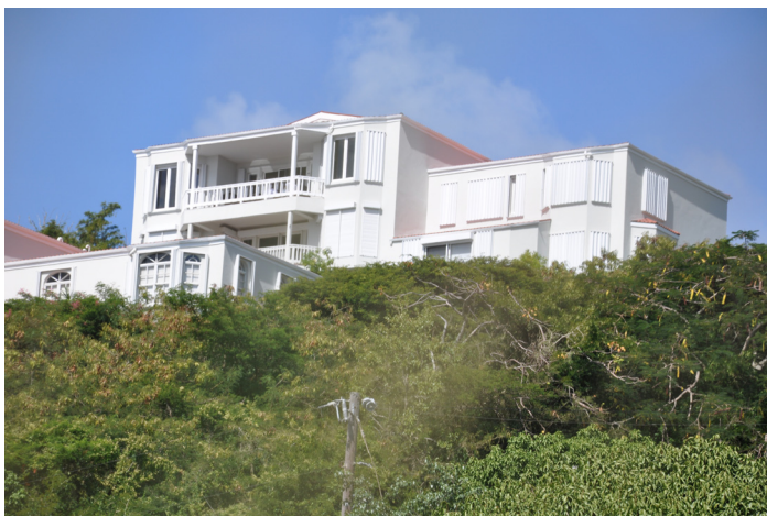
Figure 4. Hilltop Development

Recommendations: (1) Definitions of height, story, grade, mezzanine, and structure each need a thorough review and revision. (2) To ensure predictability regarding the size, appearance and density of future development we recommend that building height be measured in feet rather than stories. (3) Depending on the number of stories permitted in a district, the height limit could assume a minimum height of 10 feet and a maximum height of 15 feet per story. The precise figure should be based on an evaluation of the prevailing height of existing buildings of each number of stories and, if possible, some visual modeling of what various proposed heights would look like in future development.