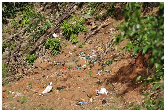
Figure 10. Erosion

Considering the prevalence of steep slopes on St. Thomas and St. John, there is no minimum or maximum vertical grade for streets, although there are typical cross sections for roads (Figure 17, Handbook , p. 64) and suggestions on how to configure lot lines so they run parallel to contour lines (Figure 18, Handbook , p. 64) in mountainous terrain. Similarly, there are no written or graphic design standards in the Handbook for slope stabilization and erosion control, during and after construction.