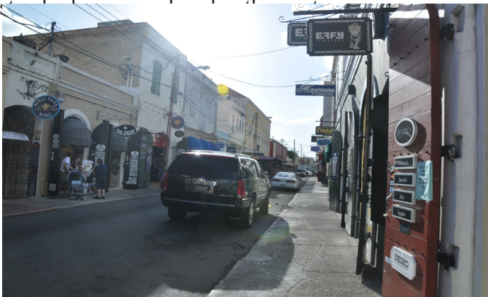
Figure 5. Charlotte Amalie Street Scene