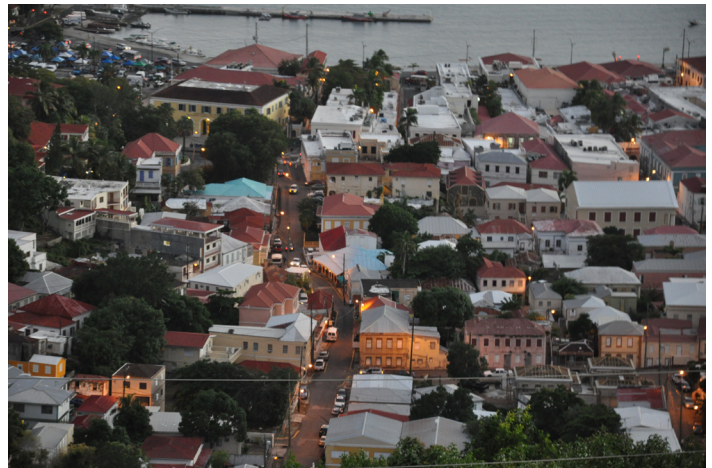
Figure 1. Land Development

policies, many interviewees stressed the importance of tailoring plans and zoning and subdivision codes to the unique needs of the three islands in contrast to a one-size-fits-all approach that has always been in use. “Each island community has to have a discussion about the kinds of things we would like to see happen,” said one participant.