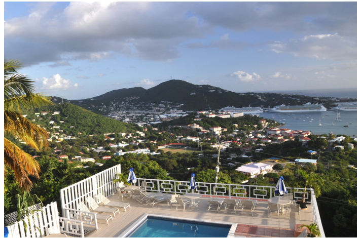
Figure 7. Hillside Development

The current code does not adequately address development on steep slopes, which is where so much residential development currently occurs and will continue to occur. There is widespread concern regarding stormwater run off, filling of guts, improper contouring of lots, driveways, and roads, and negative visual impacts of large residential structures on hillside lots.