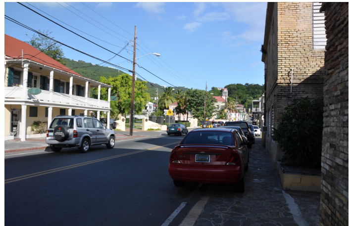
Figure 9. Street Scene in Charlotte Amalie

Because of the inability of the government to keep up with maintenance of public easements and alleyways, the Planning Office recommends that whenever possible the rights-of-way of the streets and roads be used for the placement of sanitary sewer lines, water distribution lines, storm drainage facilities, and power lines. It is recommended that in new subdivisions consideration be given to underground conduits for power lines, telephone lines, and cable television lines. (Italics supplied) ( Handbook , 51-52).