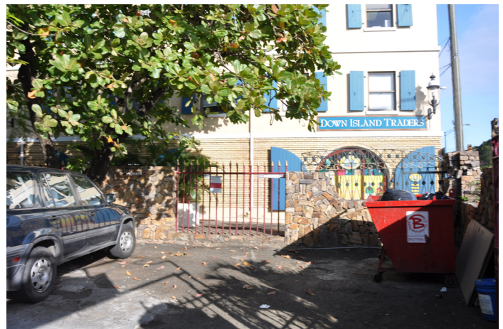
Figure 6. Existing Parking Area

Required off-street parking. For each zoning district this sub-part contains a cross reference to Sec. 230. (Off-Street Parking). When the code is reorganized to include a new Table of Development Standards, a stand-alone section for off-street parking standards should be established. A cross reference to such a section could then be included in the Development Standards table we are proposing.