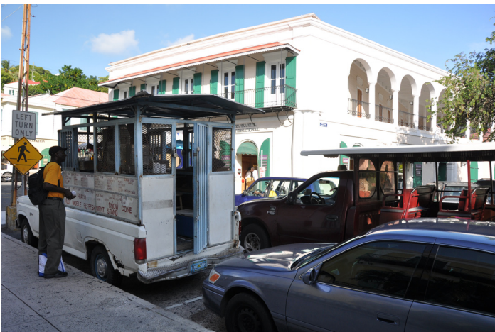
Figure 8. Street Scene in Charlotte Amalie

Subdivision regulations are land use controls that govern the general division of land into two or more lots, parcels, or sites for building. They have a number of regulatory purposes. They ensure that improvements to be constructed and dedicated to the public will be built and will be easy and economical to maintain. Through the review of the development, the government can check proposed water supply and sewage treatment collection and disposal systems for adequate compliance with applicable health and environmental standards. Subdivision regulations also control the internal design of the subdivision and require that street patterns and intersections are safe, and lots are laid out in such a way as to take advantage of the properties amenities, and provide well-drained and properly oriented building sites with access to public streets.