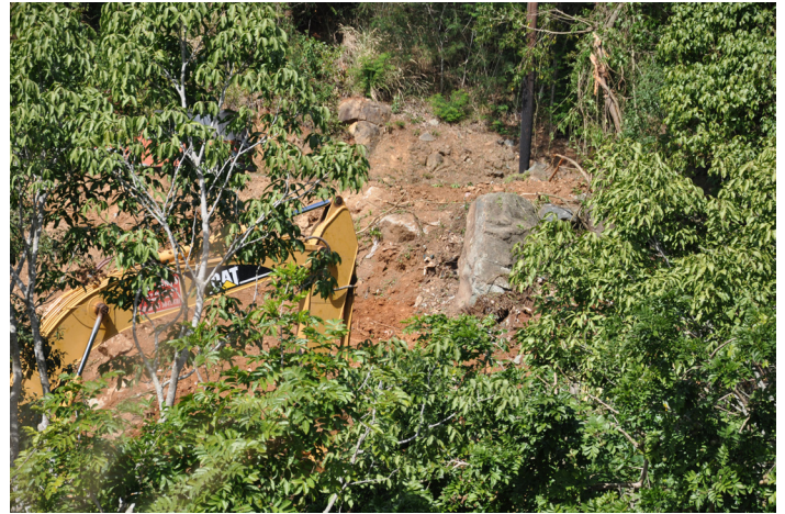
Figure 2. Hillside Grading

In terms of specific technical changes or modifications that need to be made to the laws, almost everyone agreed that the definitions of certain terms and concepts, including building height, how height is measured, story, grade, and mezzanine need to be clarified. A number of people said the earth change (grading) regulations need to be fixed to address development on steep slopes, which is all too common.