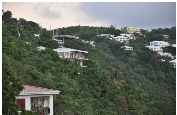
Figure 3. Hillside Development

Height of building —In the case of buildings with flat roofs, the vertical distance from the lowest adjacent grade level to the highest point of any roof, excluding cornices, parapet walls, or railings and, in the case of sloping roofs, the vertical distance from the lowest adjacent grade level to the highest point of the highest roof.