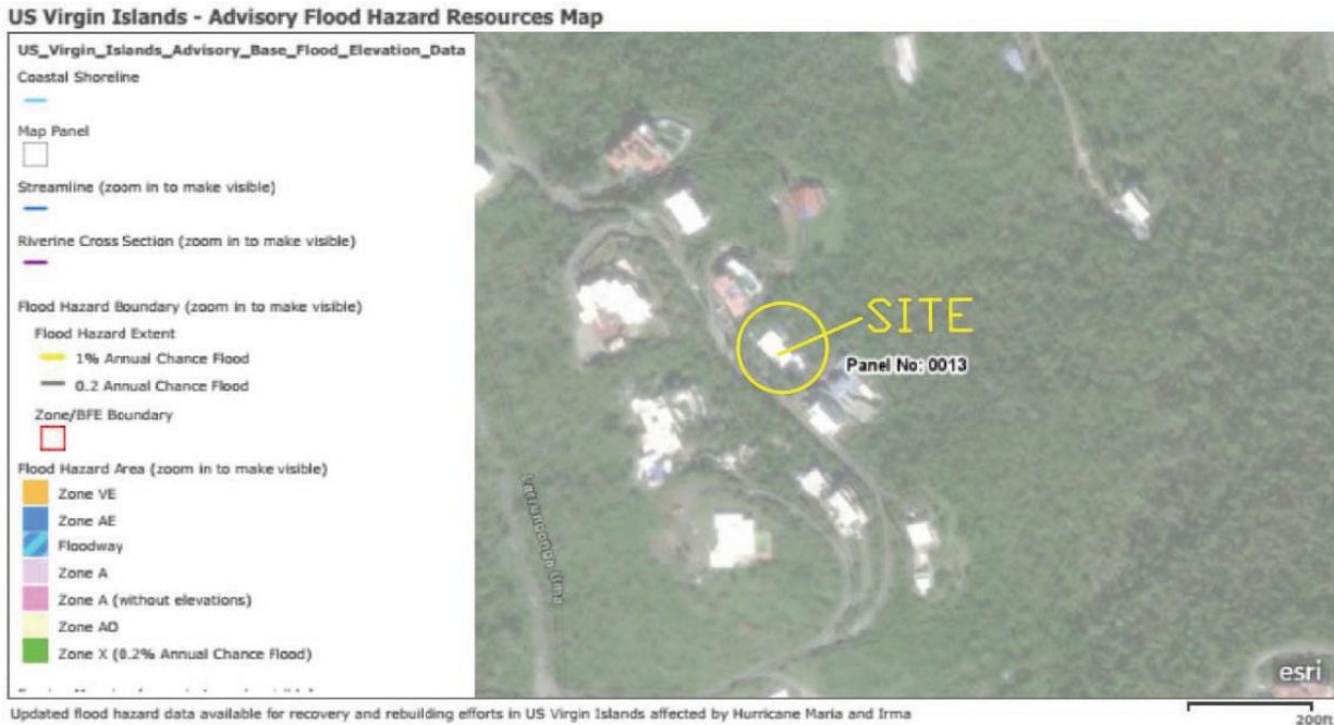
Figure 5. FEMA Flood Advisory Map

According to Panel 0013 of the US Virgin Islands Advisory Base Flood Elevation Maps, the project area is not located within flood zones. Finished floor elevation for the proposed building is 482 feet.