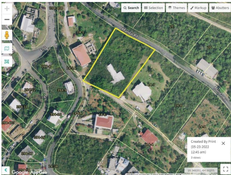
Figure 1: USVI GIS online MapGeo

This project area comprises 0.60 acres track of land owned by the Government of the V.I. and is located at 14-2 East End, Annas Retreat, St. Thomas, U.S. Virgin Islands. The property ID# is 103104041100.