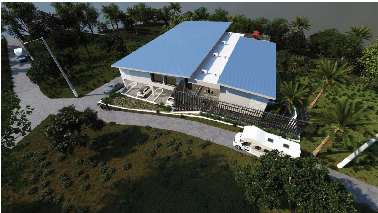
Figure 8: Aerial View Rendering

The new design considered the V.I. Architecture and includes sloped concrete roofs and walls, impact resistant windows and doors for resisting hurricane and seismic forces. The buildings will be insulated per the new building code standards at the roof and walls. The metal roofs will provide long lasting weather protection. The high efficiency plumbing, HVAC and light fixtures will provide savings in water and electricity consumption. The interior finishes will include recycled and low VOC materials. Thus, the buildings will be less burden to environment meanwhile providing better setting for its occupants.