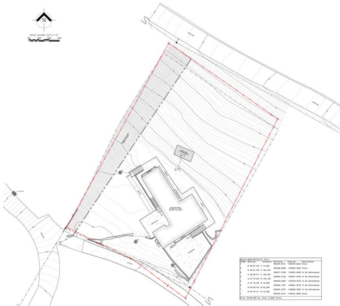
Figure 3: Existing Conditions Survey of Site

The site is mostly developed and occupied by a two-story structure, concrete floor outside concrete pads and a septic tank. The site has no parking spaces. This building is constructed of 8" concrete masonry unit (CMU) walls with corrugated galvanized roofs and reinforced concrete floors. The property is currently abandoned.