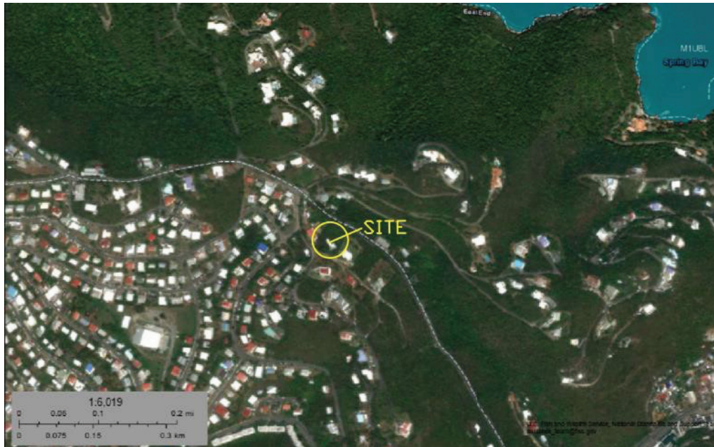
Figure 6: National Wetlands Inventory Maps

According to the National Wetlands Inventory Maps, published by the US Fish and Wildlife Service, the project area is not affected by Wetlands.