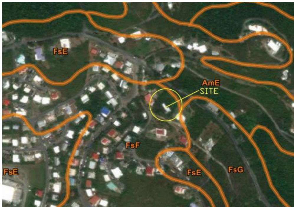
Figure 4: USDA Soil Survey Map

According to the USDA – Natural Resources Conservation Service, these soils are not considered as hydric, nor has hydric inclusions.