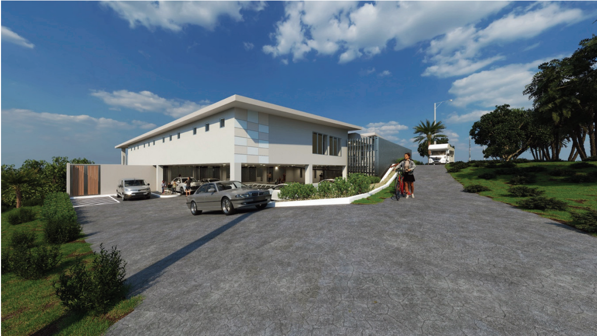
Figure 9: Eye level View Rendering