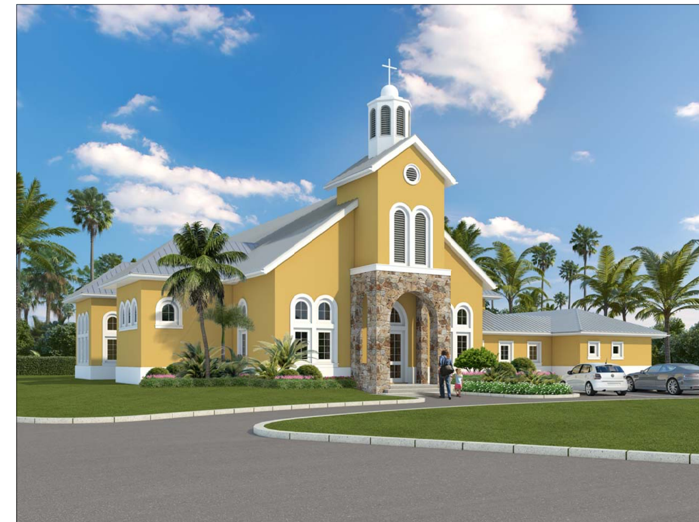
3 CHAPEL RENDERING