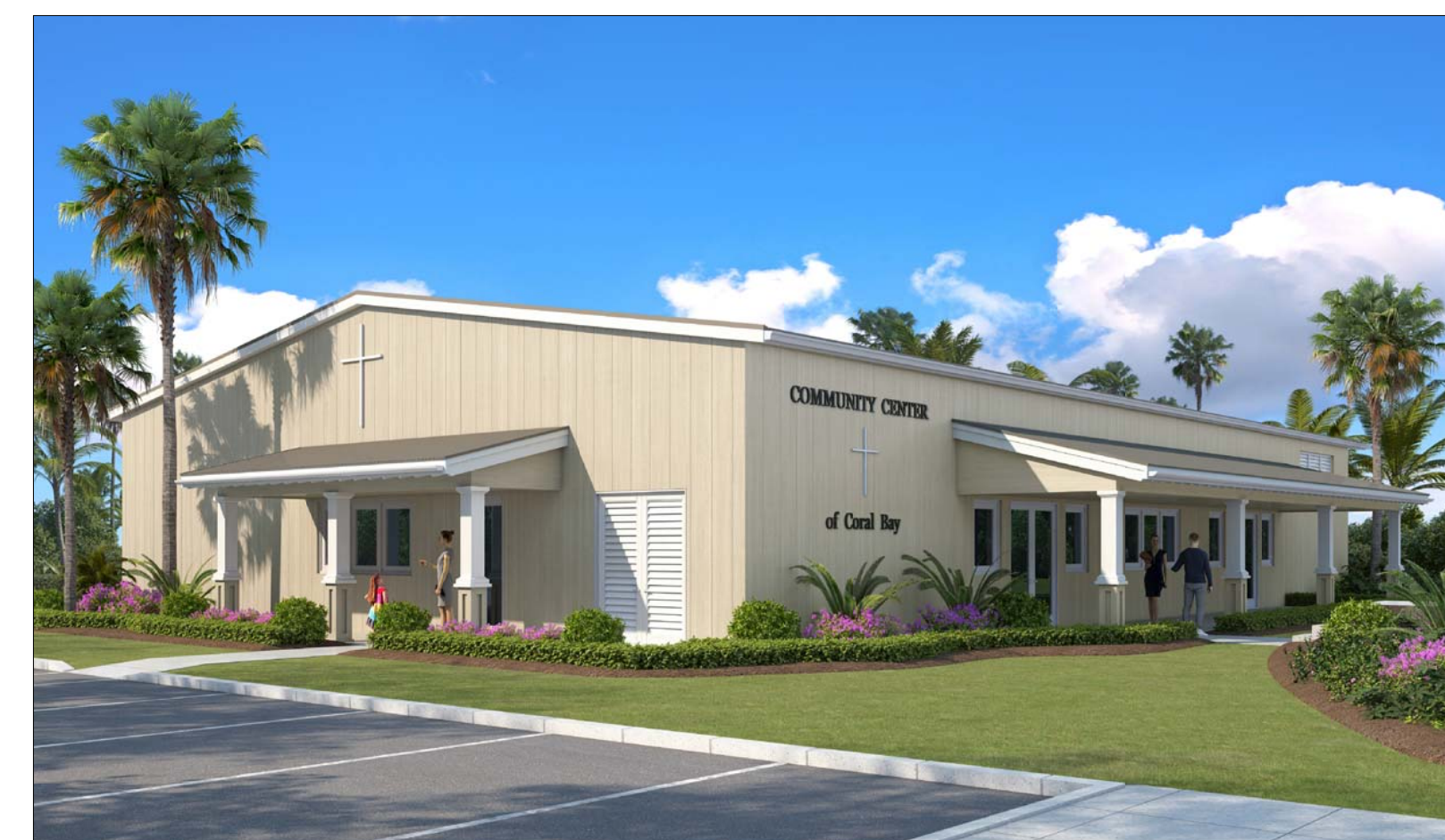
4 COMMUNITY CENTER RENDERING