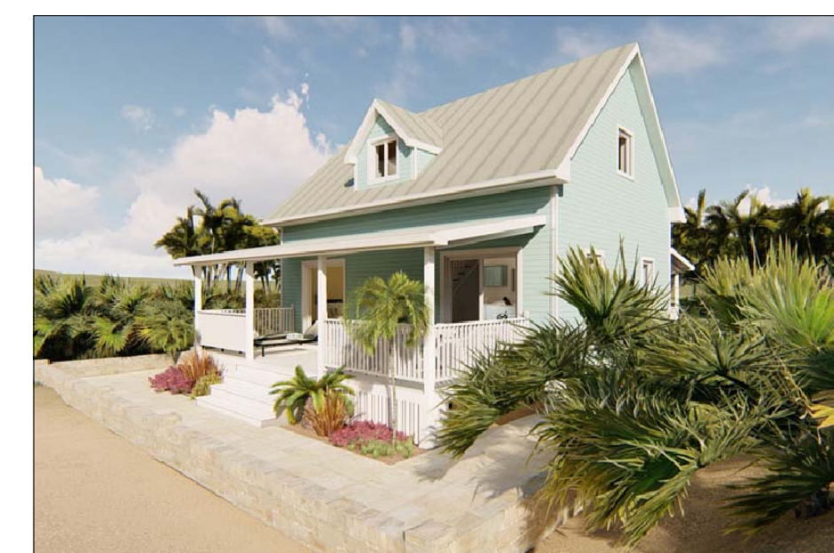
5 RESIDENCE RENDERING