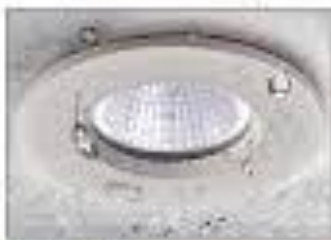
Indoor Damp and Wet Locations

New provisions for GFCI protection were added for non-dwelling unit locations for receptacles: