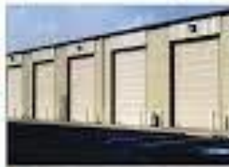
Garages, accessory buildings, and service bays