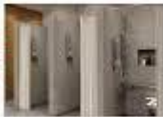
Bathtubs and shower stalls